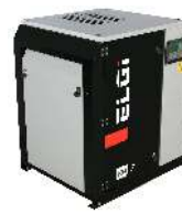
EN Series Rotary Screw 2.2 - 75 kW / 8.0 - 469 cfm