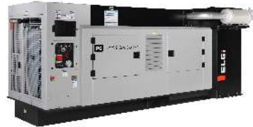
Diesel Portable (Skid) 500 - 1500 cfm / 150 - 400 psi