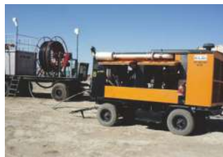
Uranium hole blowing