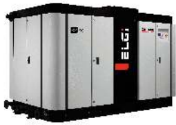
Oil-Free Series Screw 90 - 450 kW / 480 - 2515 cfm