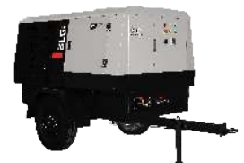
Electric Portable (Trolley) 22 - 75 kW / 131 - 490 cfm