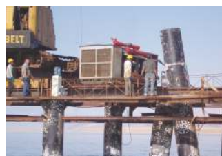
Mining in dead sea