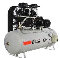
Oil-lubricated Recip 1.0 - 40 HP / 2.0 - 128 cfm