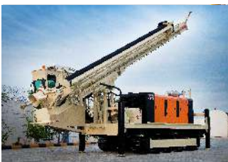
Blast hole drilling