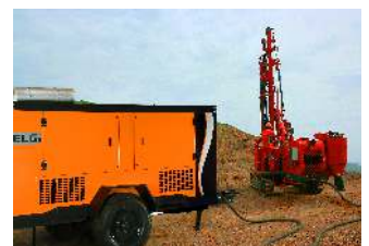
High pressure compressor for crawler drilling