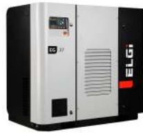
EG Series Rotary Screw 11 - 250 kW / 47 - 1612 cfm