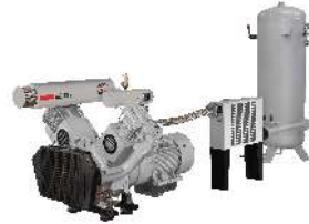
Oil-free Recip 1.0 - 75 HP / 1.8 - 300 cfm