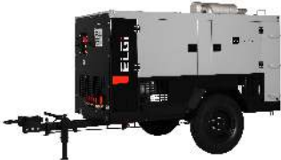
Diesel portable (Trolley) 185 - 1100 cfm / 100 - 300 psi